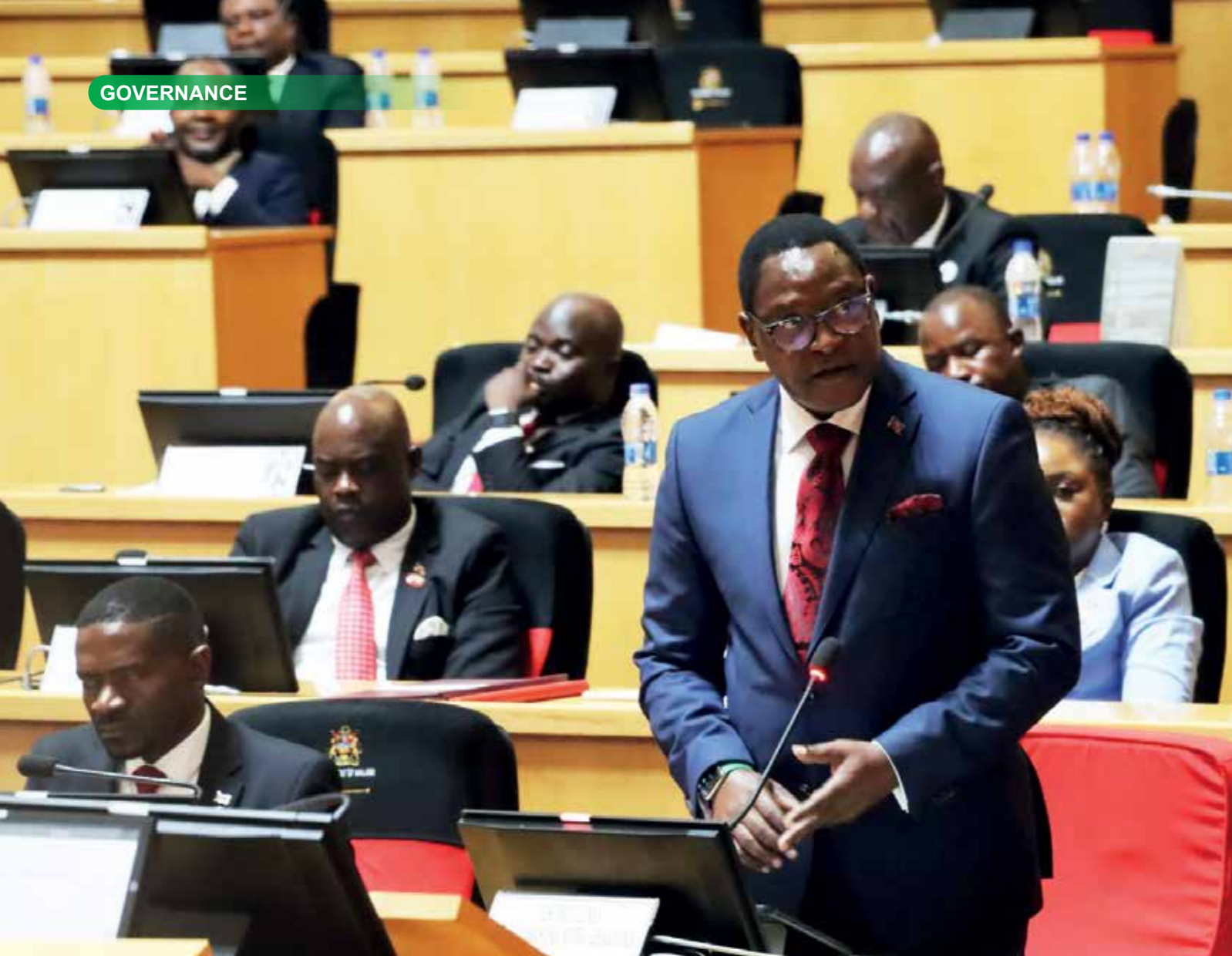
President Lazarus Chakwera responding to members of parliament during the December 2024 presidential question time.