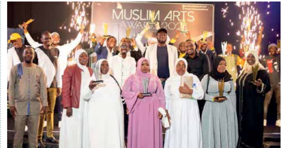
Award recipients and event organizers capture a memorable moment in a group photo at the Muslim Arts Awards.