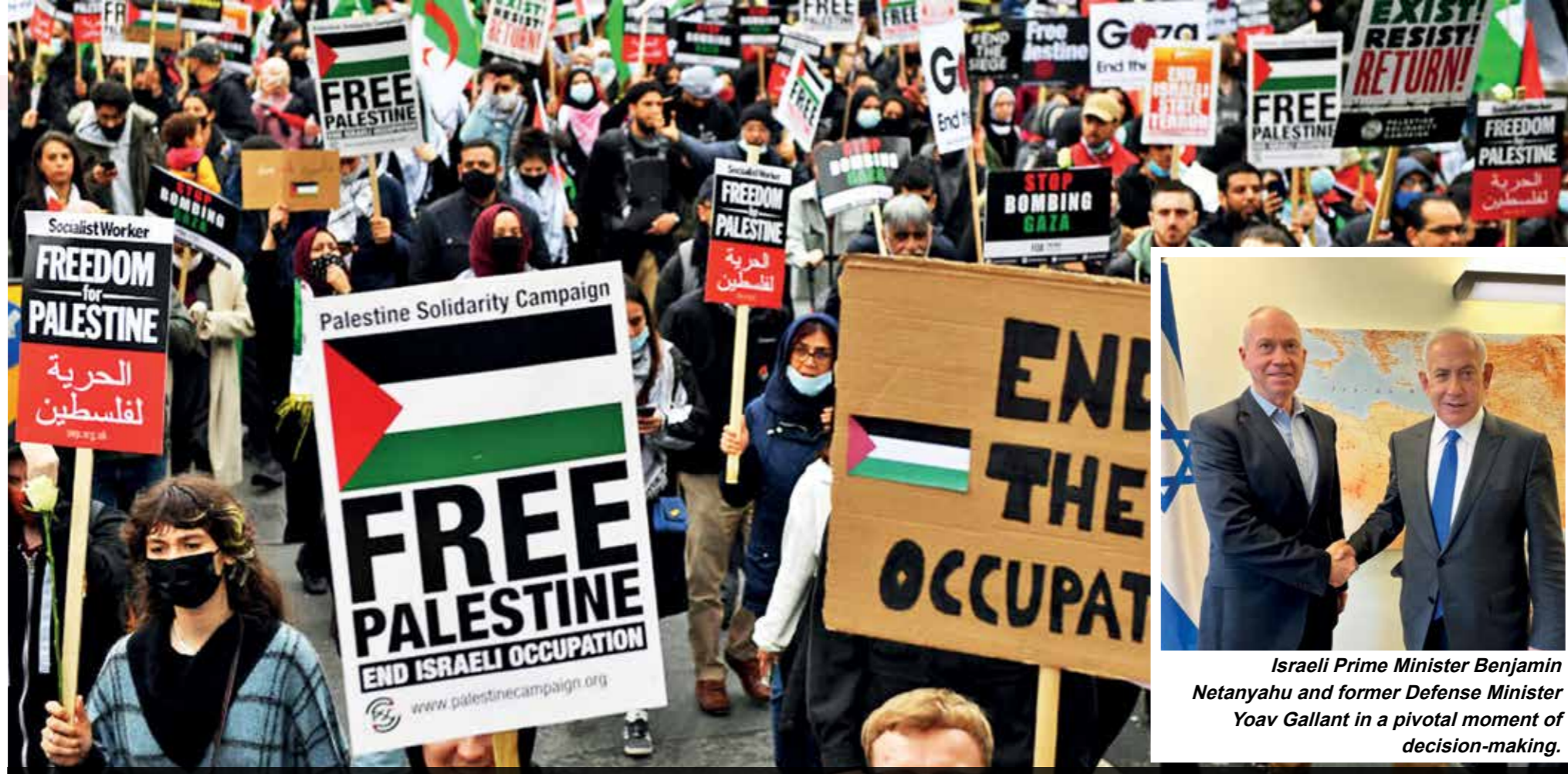
Global Solidarity: Palestinians and their supporters unite in powerful protests across Gaza, Lebanon, and beyond, calling for justice and an end to the ongoing conflict with Israel.

These legal actions coincide with a devastating humanitarian crisis in Gaza. Thousands of Palestinian civilians have been killed, while critical infrastructure has been obliterated, leaving millions facing severe shortages of food, water, medical supplies, and shelter. Despite these dire conditions, the global reaction to the ICC's action has been divided, reflecting varied political alliances and interests.