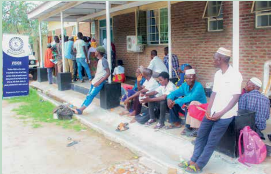
Beneficiaries at Mangochi District Hospital receive life-changing cataract surgeries facilitated by IHAM.