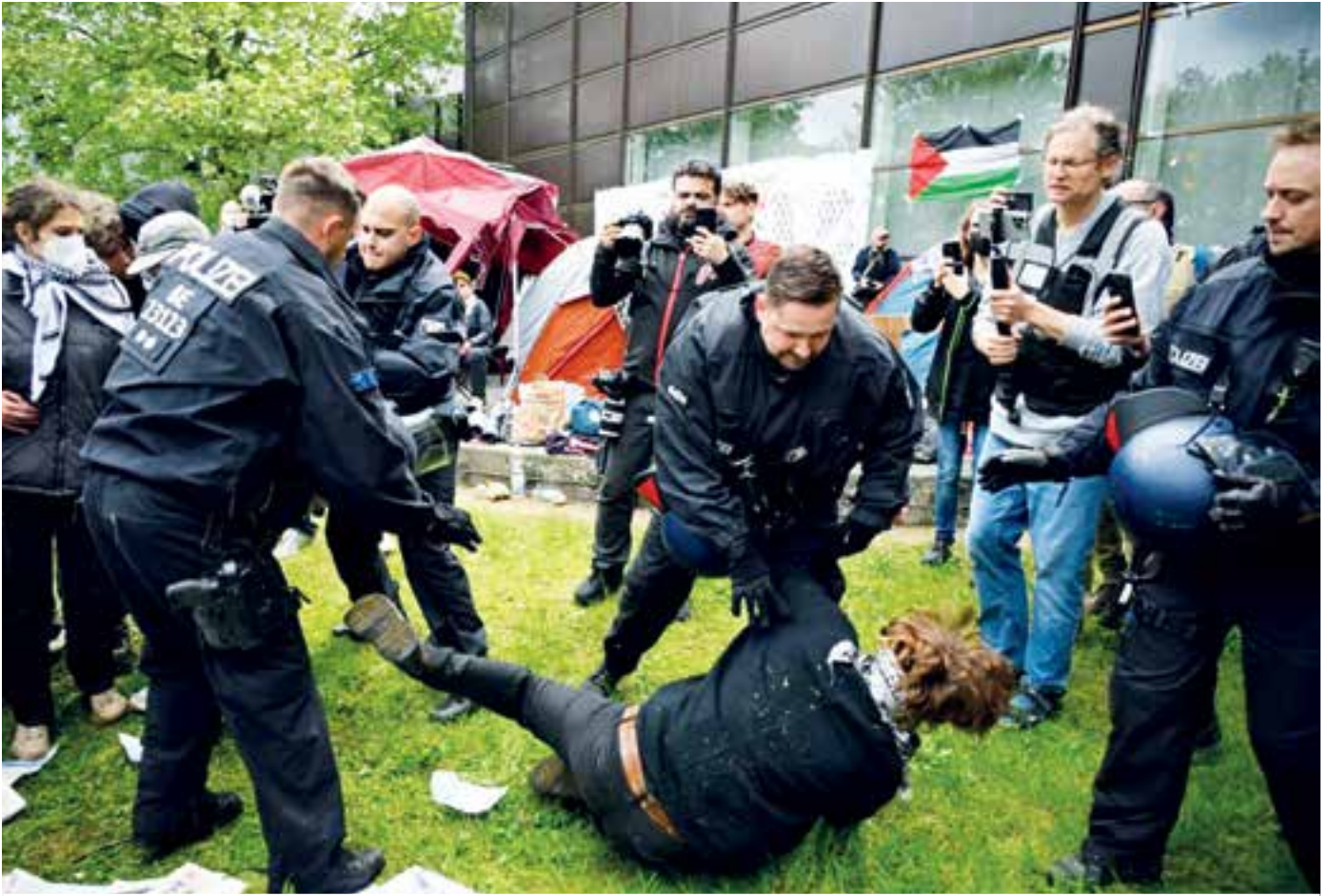
Police officers try to remove a pro-Palestinian protester at the campus of Free University of Berlin