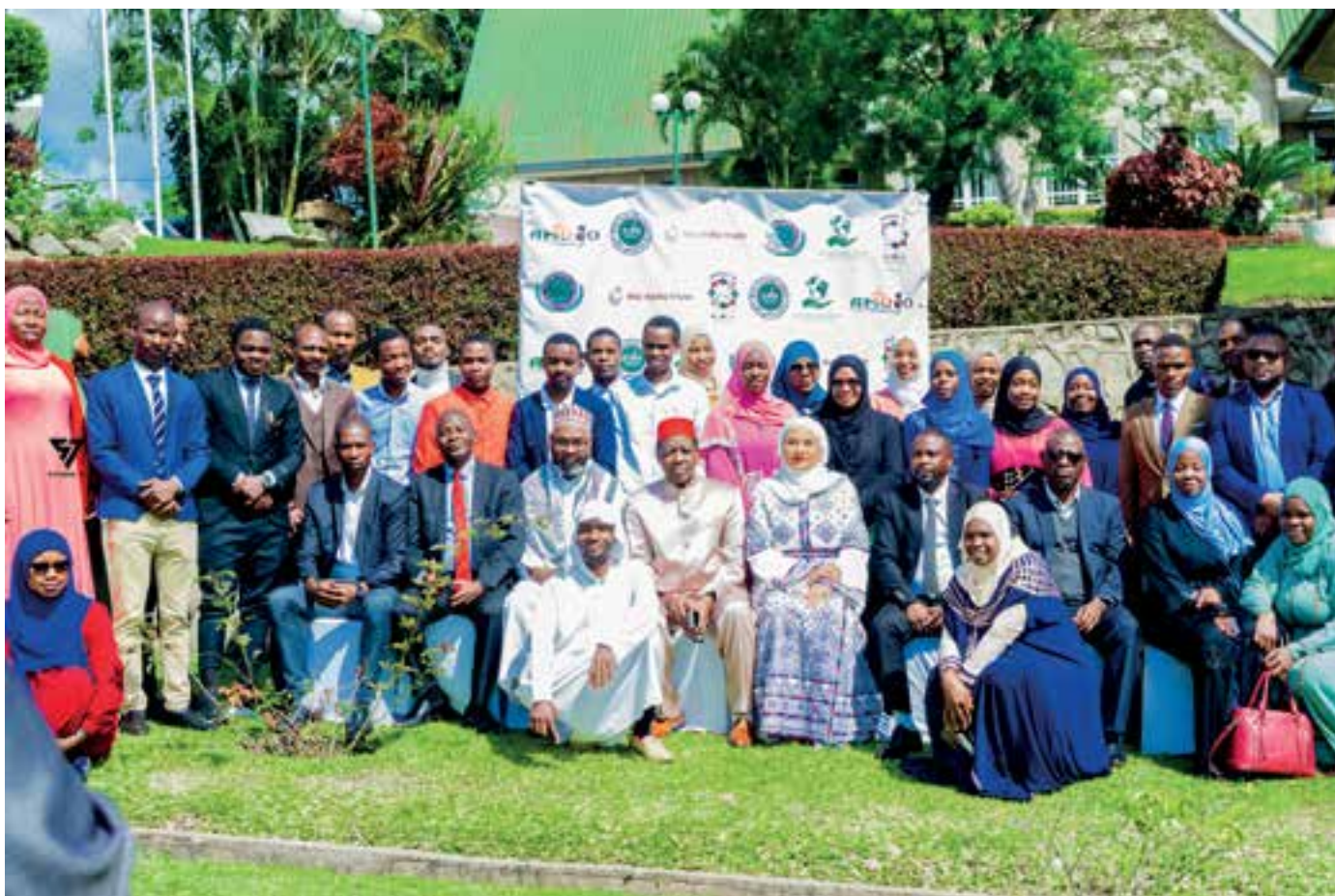
Invited guests and delegates at AMUJO annual general meeting