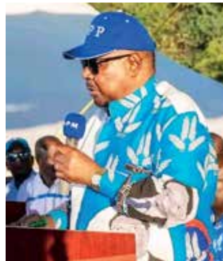
Am ready to take over, Prof. Peter Mutharika