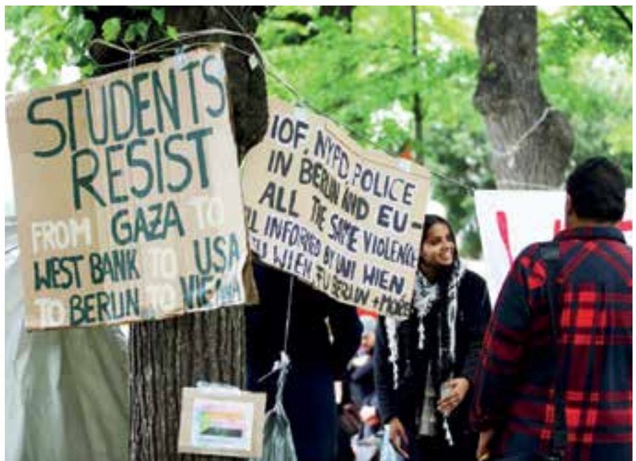
People hold banners at a pro-Palestinian protest camp at the Vienna University campus in Vienna, Austria

In Austria, dozens of protesters camped on the campus of Vienna University, pitching tents and stringing up banners.