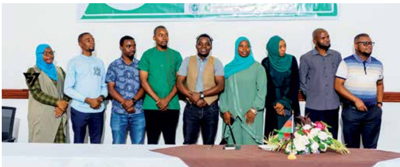
The newly elected Executive Committee for AMUJO

The meeting was funded by the Darusunnah Foundation, the Muslim Association of Malawi, the National Awqaf SA, the Al-Baraka Charity Trust, and YIP Construction.