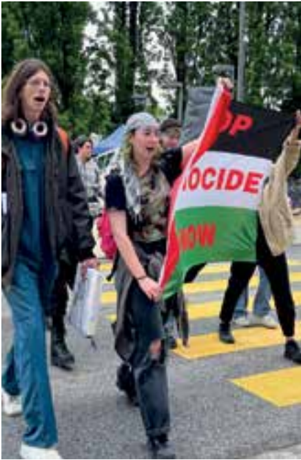
Students take part in a pro-Palestinian protest at the University of Lausanne, Switzerland

Earlier, at Free University, in the German capital Berlin, police cleared a demonstration after up to 80 people erected a protest camp in a campus courtyard.