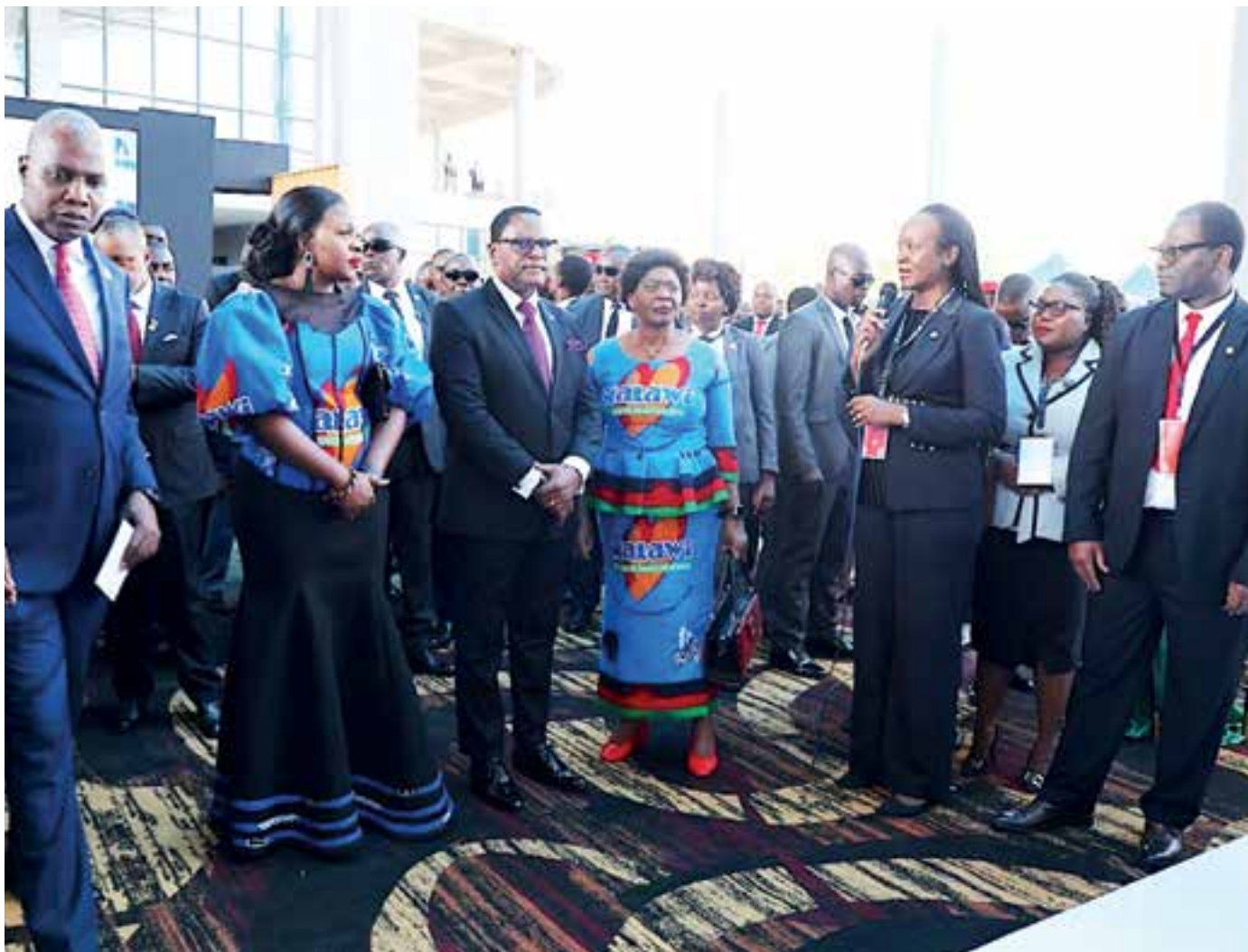
President Chakwera briefed on tourism services