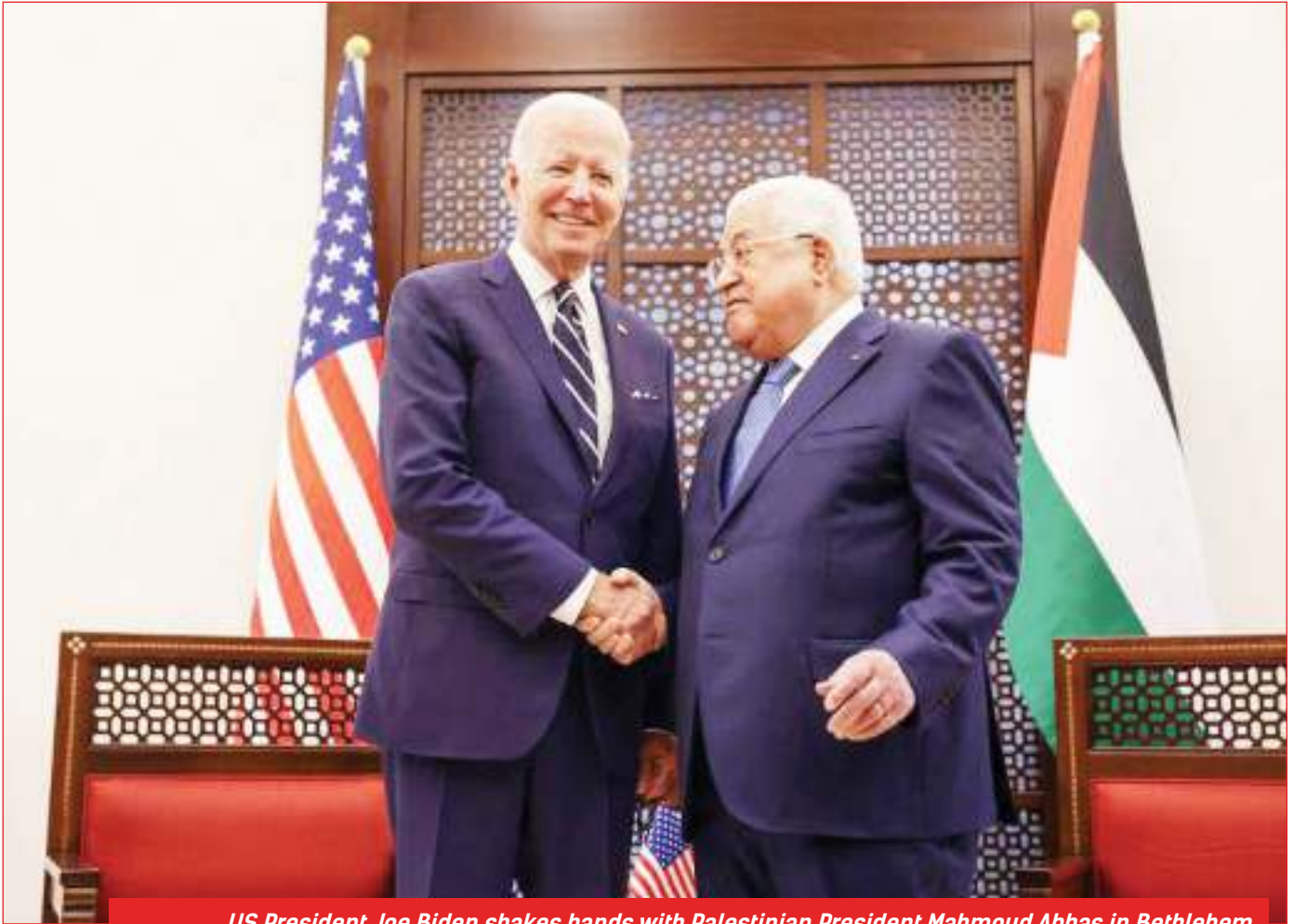
US President Joe Biden shakes hands with Palestinian President Mahmoud Abbas in Bethlehem.