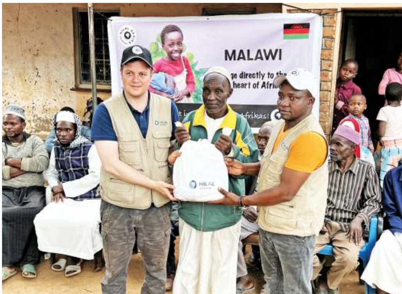
Turan and Telera handover food parcel to a beneficiary.

O ver 5000 families have benefited from the Qurban distribution program organized by Hilal Afrika in the districts of Balaka, Machinga and Mangochi. The distribution starts on the day of Eid al-Adhuha and lasts for three days. In Malawi it started on 10 July 2022.