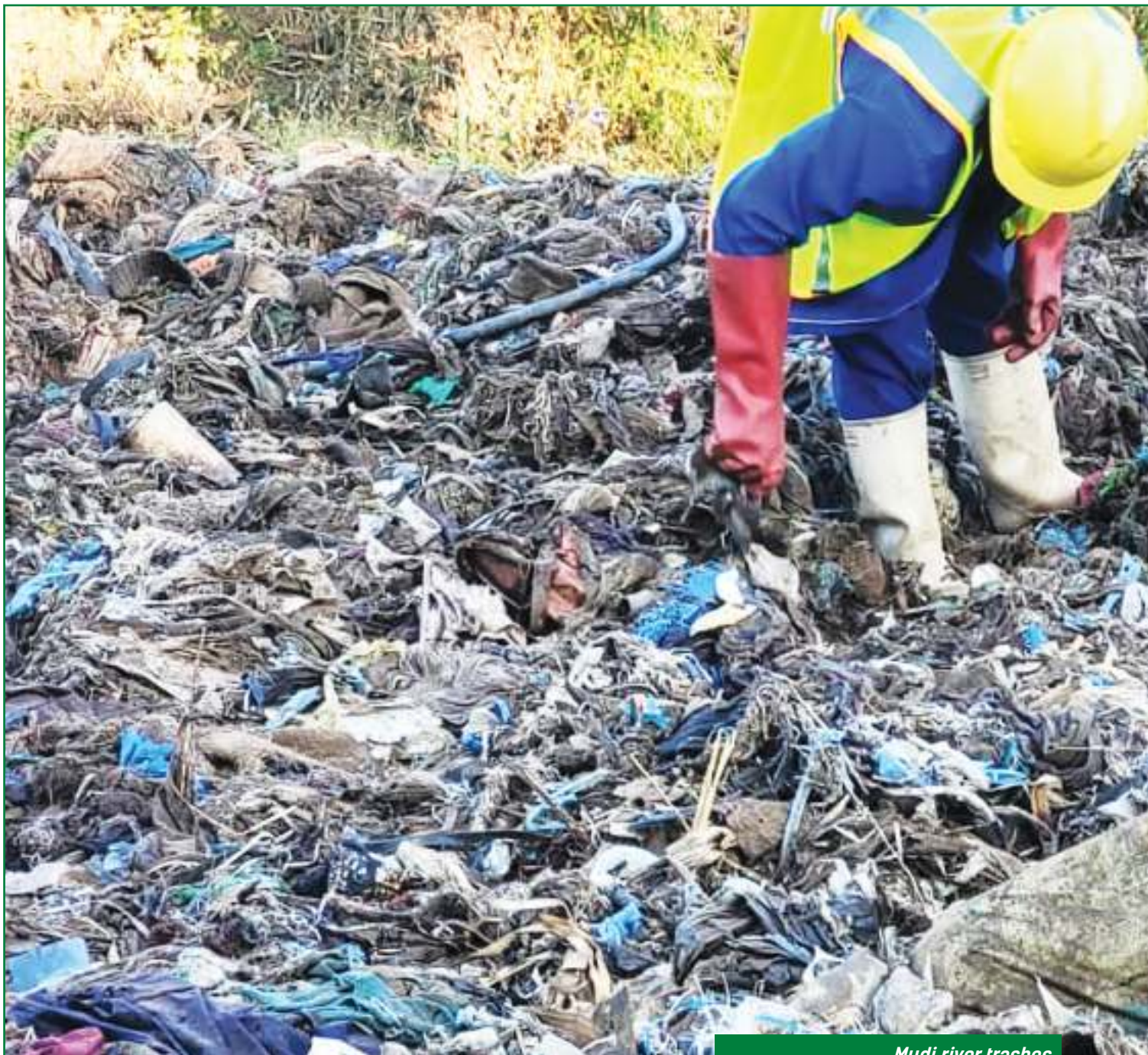
Mudi river trashes.