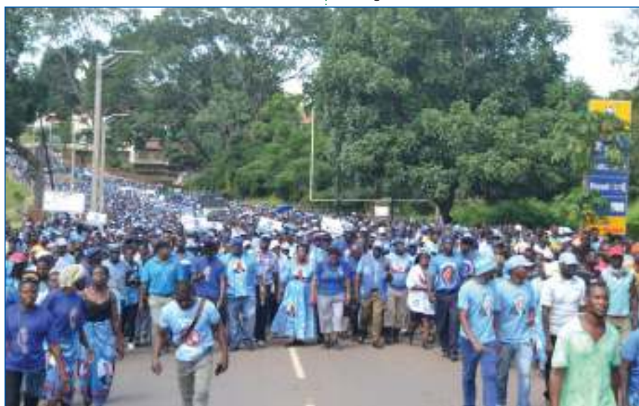
Supporters divided in two camps.

Will the dominant opposition party survive until the tripartite elections in 2025? The fight is too great for the opposing party. For the party to survive power sickness more work must be done and gain back the trust of Malawians.