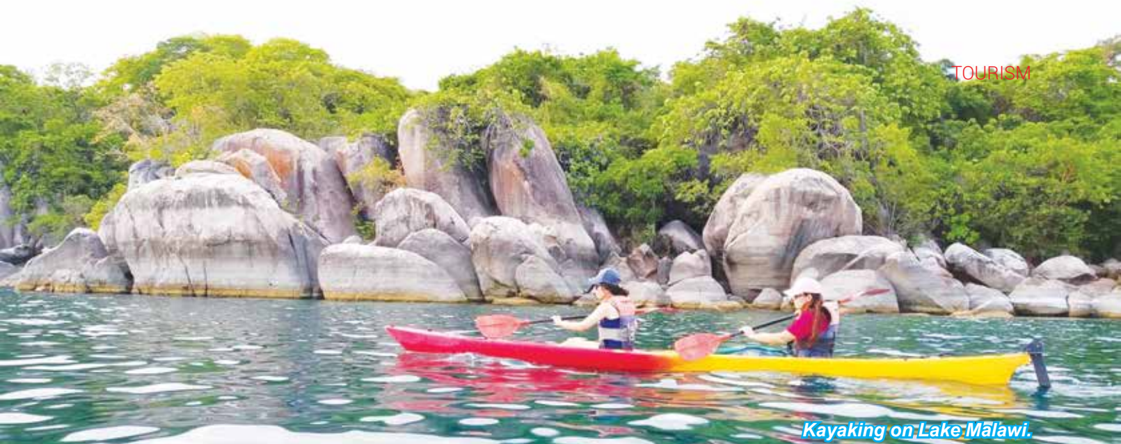
Kayaking on Lake Malawi.