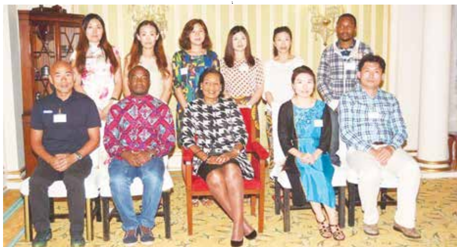
The First Lady of the Republic of Malawi, Madam Gertrude Mutharika (middle of first row) with the Chinese tour operators.

"Currently, tourism contributes about 5% to the national GDP and provides about 4% of jobs"