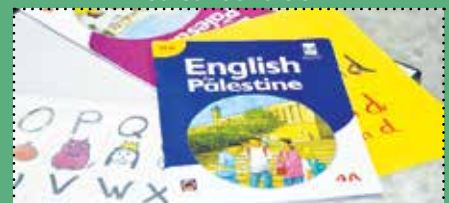
The Palestinian Authority's Ministry of Education provides the books and teachers for the Persistence school.