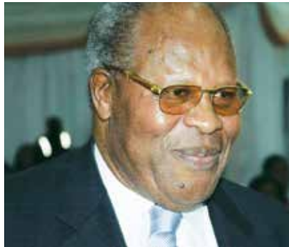
Dr Bakili Muluzi donated 200 copies to Muslim women who patronised the launch.

On the launching day, Former Malawi President Dr Bakili Muluzi became first to buy the edition when he purchased 200 copies that were donated to